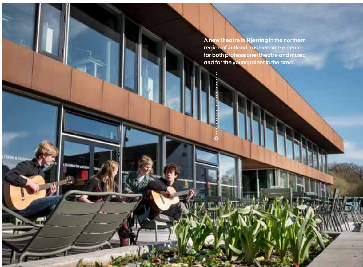
A new theatre in Hjørring in the northern region of Jutland has become a center for both professional theatre and music and for the young talent in the area.

We work with social responsibility in our core activities, because we believe that this increases their overall effect – both when we work philanthropically, when we invest, when we act as developer, and in our daily operations.