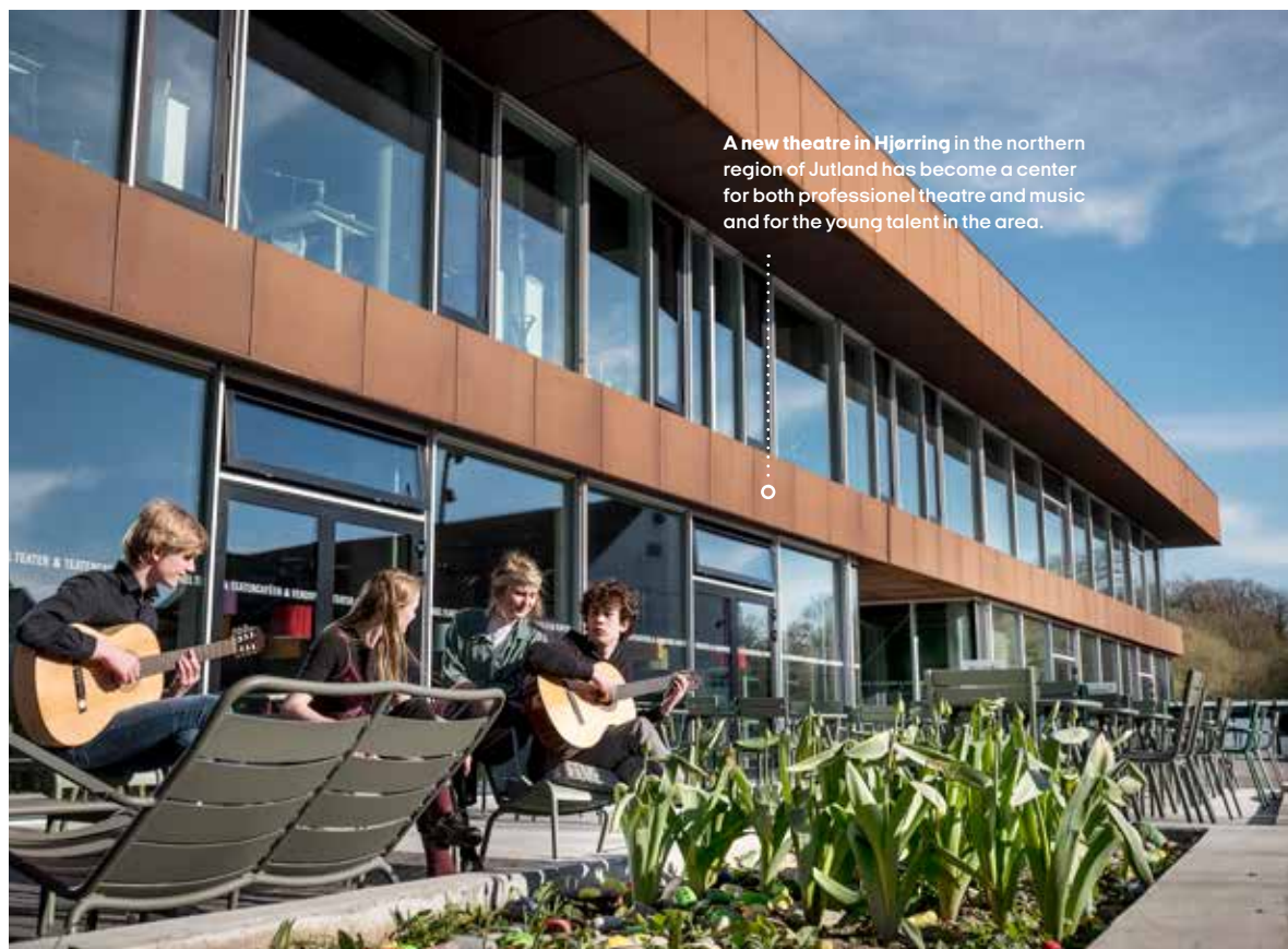
A new theatre in Hjørring in the northern region of Jutland has become a center for both professional theatre and music and for the young talent in the area.

We work with social responsibility in our core activities, because we believe that this increases their overall effect – both when we work philanthropically, when we invest, when we act as developer, and in our daily operations.